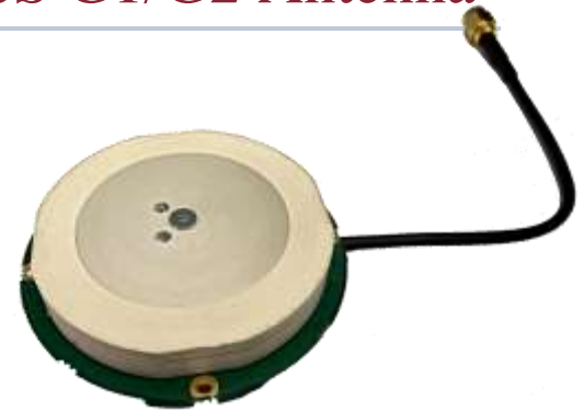
TW3870E Dimensions (mm)

The OEM TW3870E is supplied with a standard 60mm diameter circular ground plane, with a coaxial cable terminated with a connector (right angle MCX is shown in the drawing). Mounting holes are provided for attachment to larger ground planes. Custom tuning and ground plane options may be available, depending on purchase level commitment.